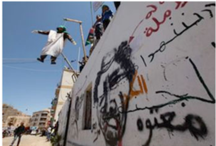
Benghazi group's Gaddafi effigy, May 22, 2011

Americans and Europeans are still less likely to learn from their media that among the groups in the Benghazi transitional coalition, certainly the most battle-seasoned, are veterans of the Al-Jama'a al-Islamiyyah al-Muqatilah bi-Libya (Libyan Islamic Fighting Group, or LIFG). The importance of the LIFG contingent in the TNC has been downplayed in a recent issue of the International Business Times :