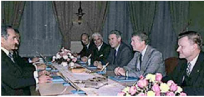
The Shah (left), Brzezinski (right), Carter (second right)

CIA Director William Casey continued this strategy of using terrorists against the USSR in Afghanistan. At first the CIA channeled aid through the Pakistani ISI (Interservices Intelligence Service) to their client Afghan extremists like Gulbeddin Hekmatyar (today one of America's enemies in Afghanistan). But in 1986, "Casey committed CIA support to a long-standing ISI initiative to recruit