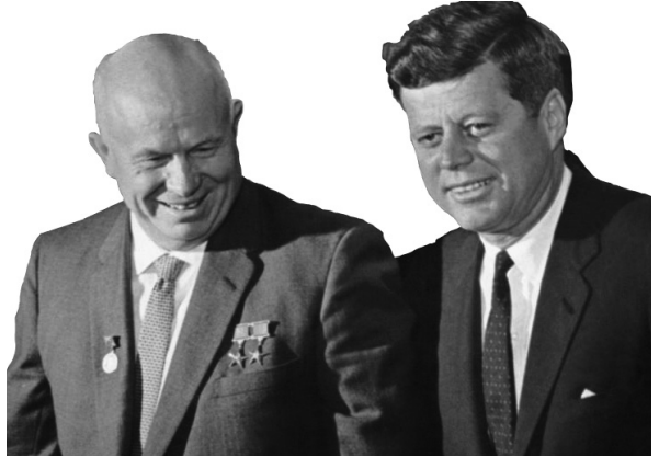
Premier Nikita Khrushchev and President John F. Kennedy

In order to understand President Kennedy's thinking, we must turn to a speech he gave at American University on June 10, 1963.